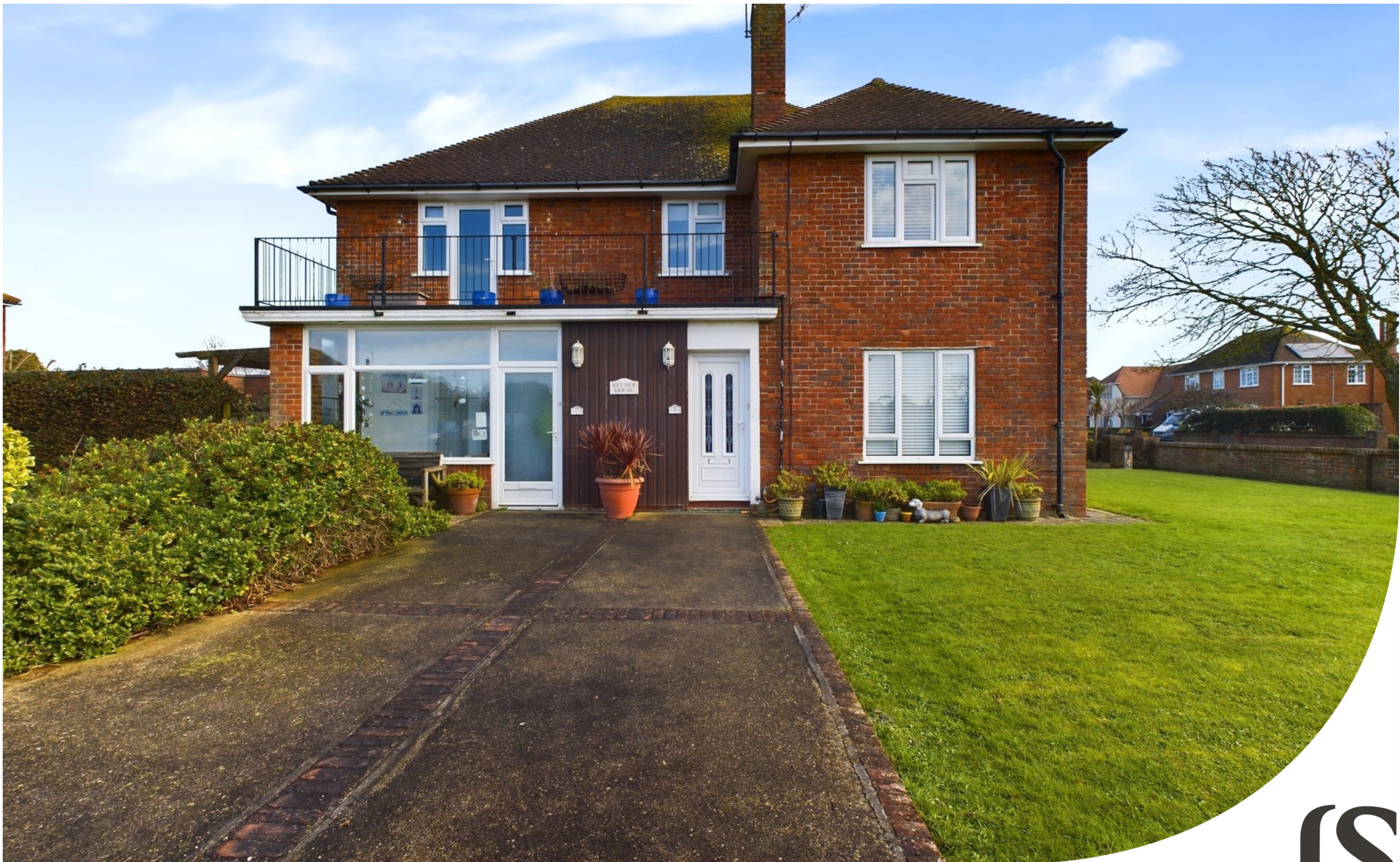
Keymer House | Nutley Avenue | Goring- By-Sea | West Sussex | BN12 4JT Offers Over £335,000