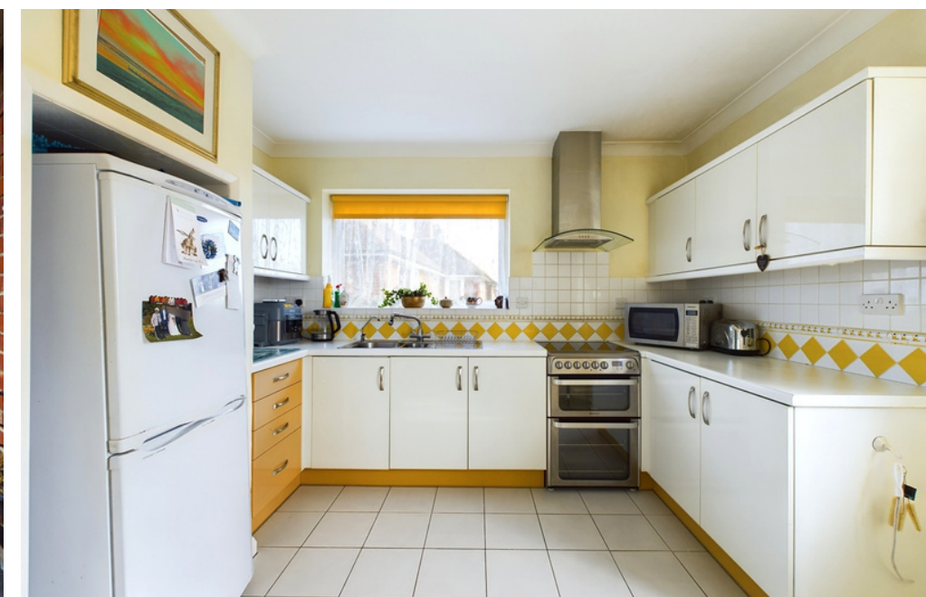
Property details: Keymer House | Nutley Avenue | Goring- By-Sea | West Sussex | BN12 4JT