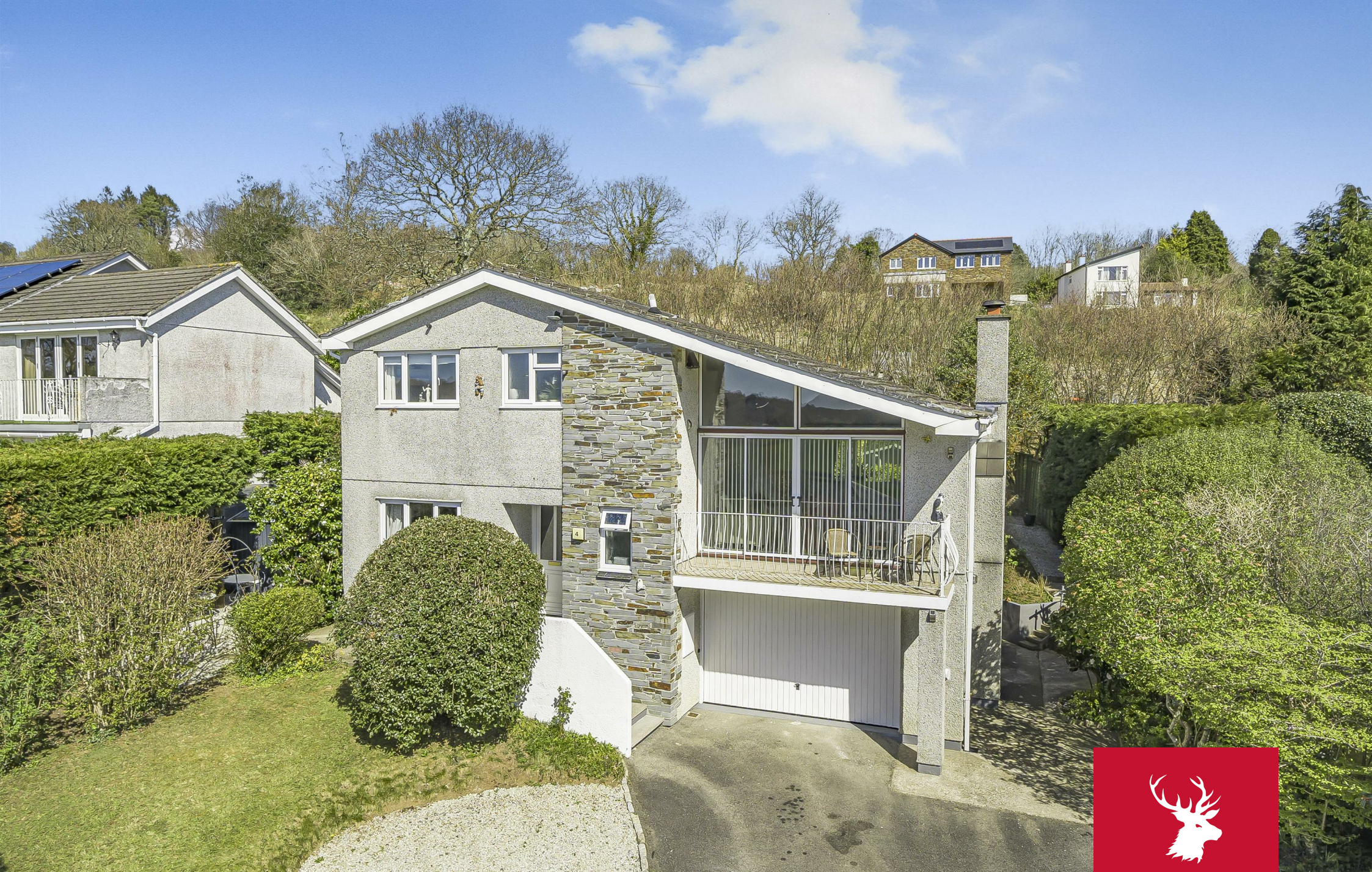
4, Johnson Park