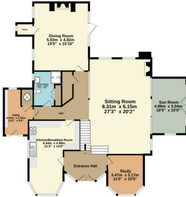
Ground Floor 161.6 sq.m. (1740 sq.ft.) approx.