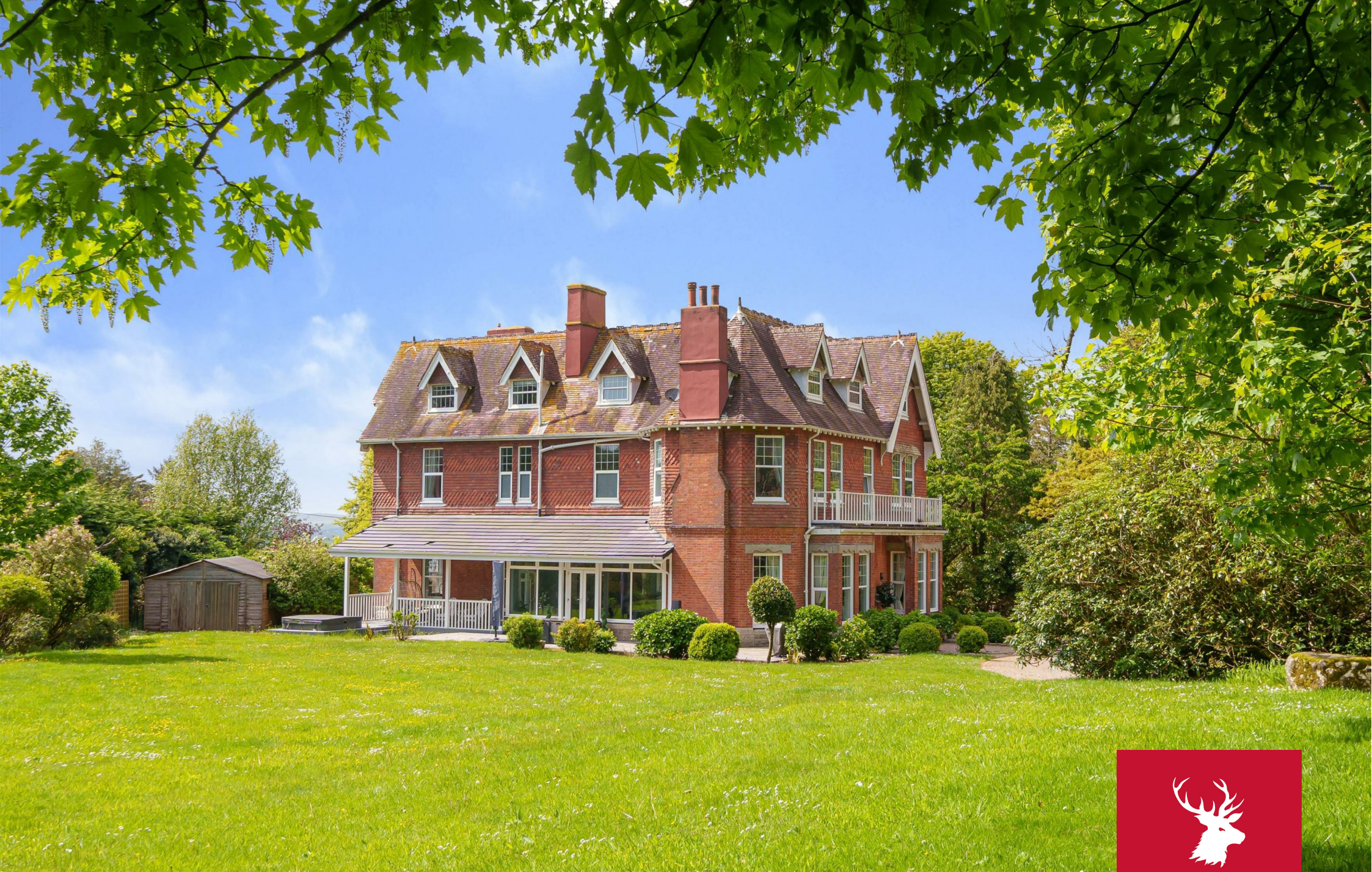
Down Park House