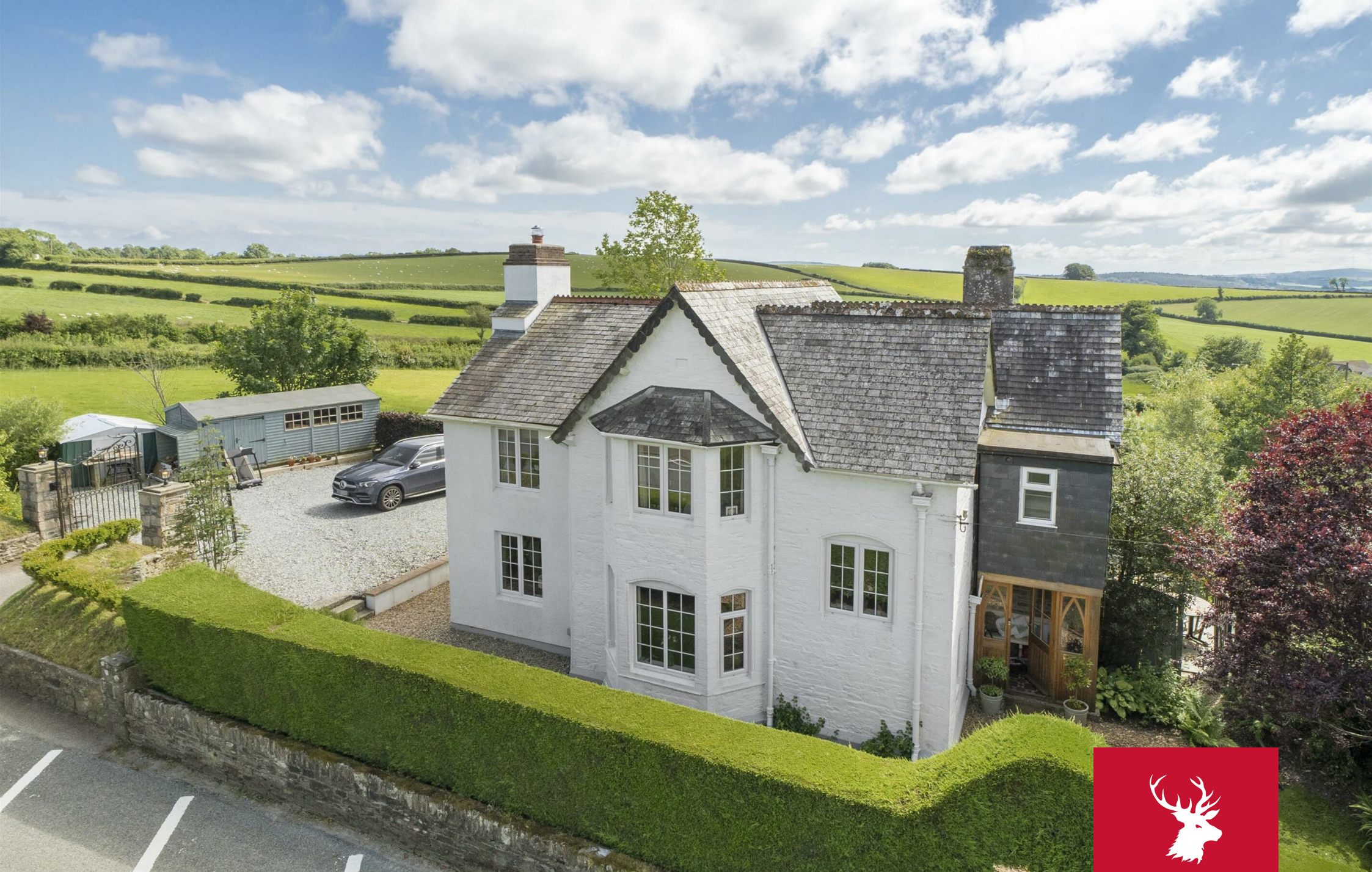
Old School House