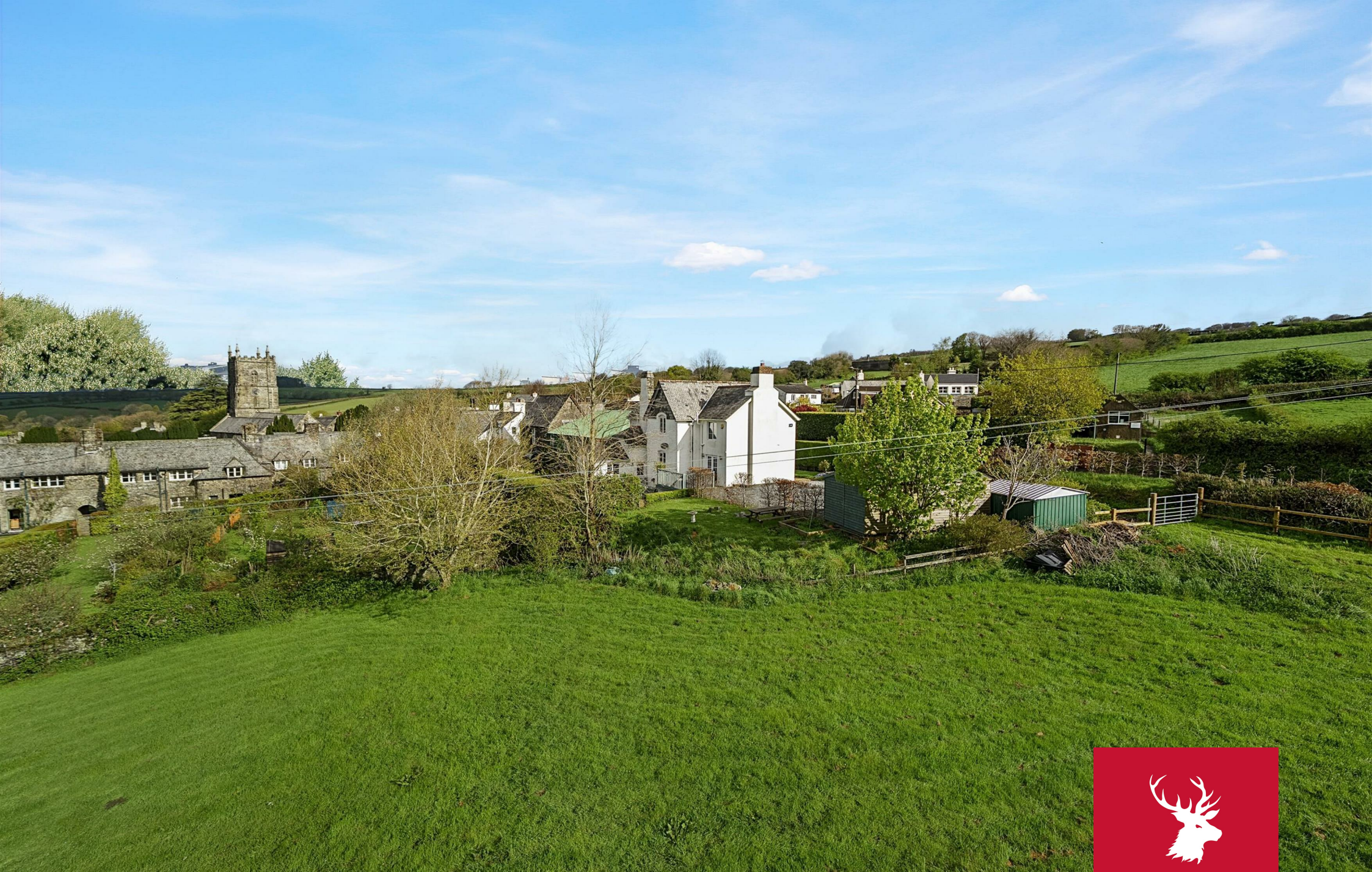
Old School House