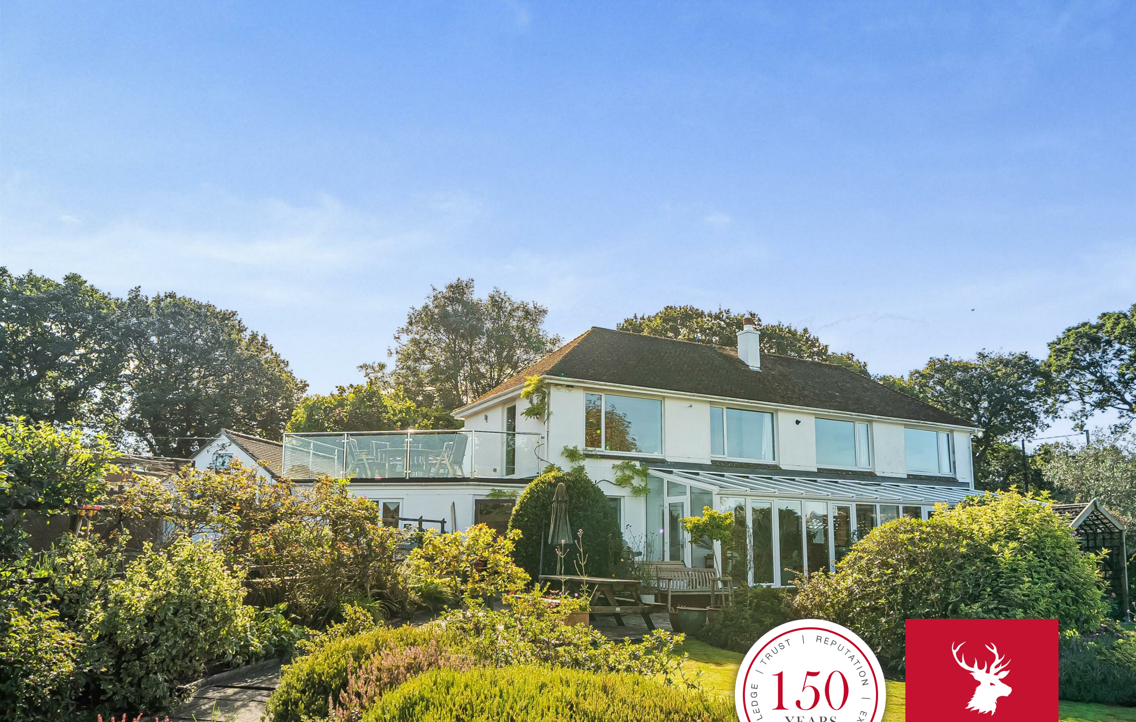
Oak Tree Lodge