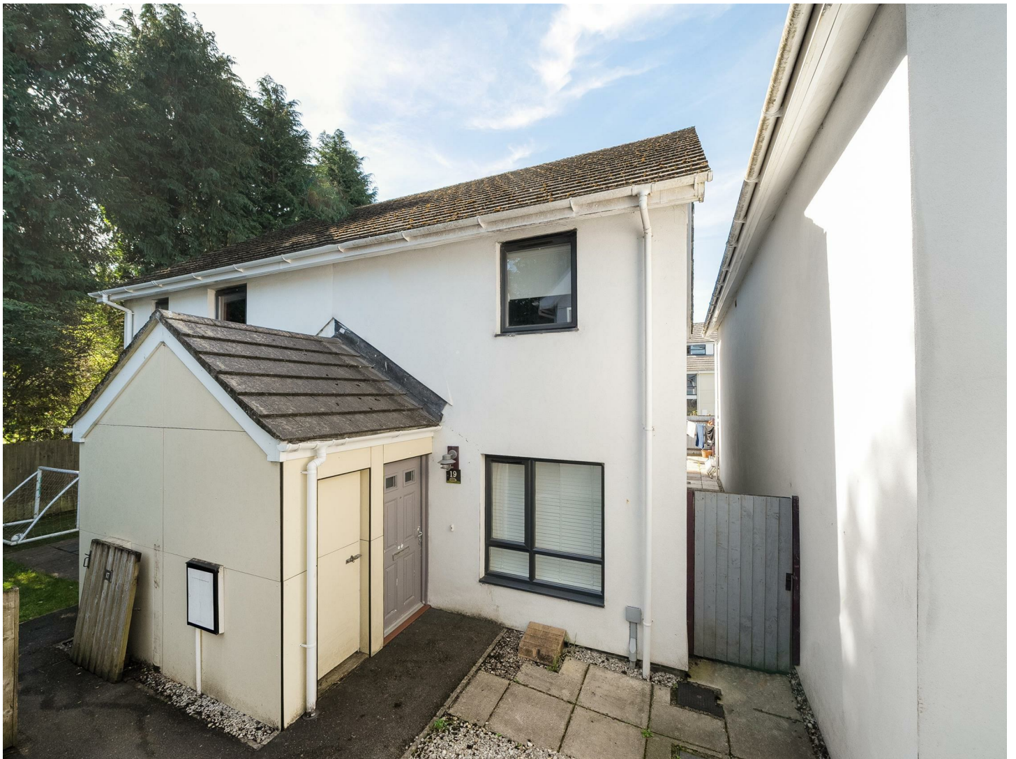
19 Grenville Meadow