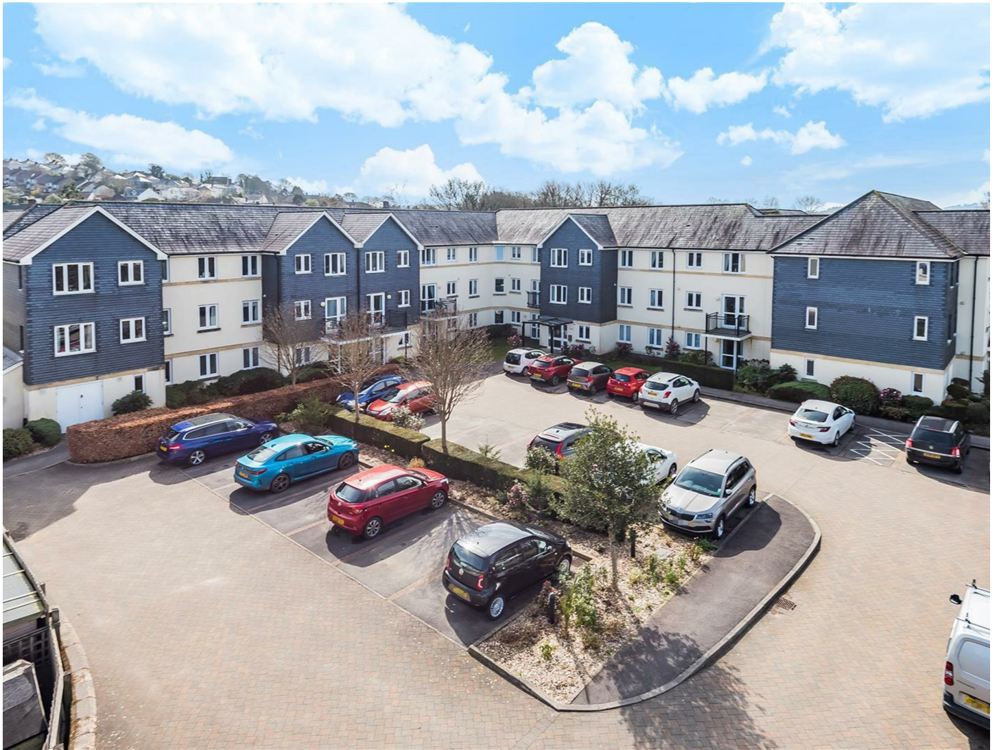
20 St Johns Court