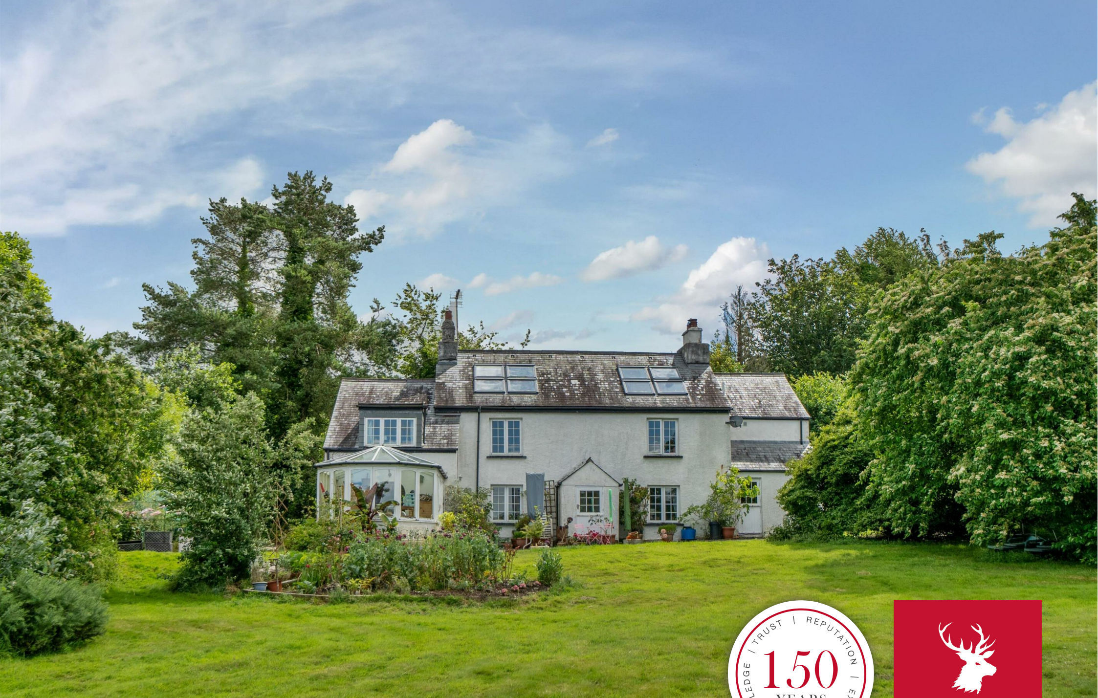
East Crowndale Farm