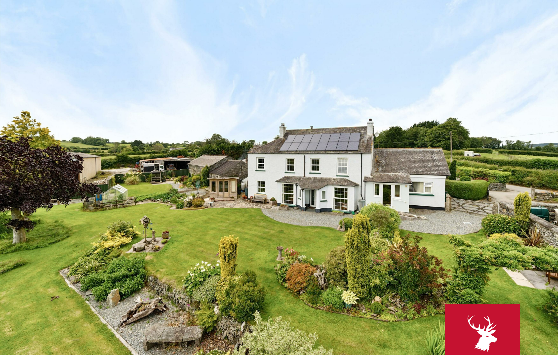
Ottery Park Farm