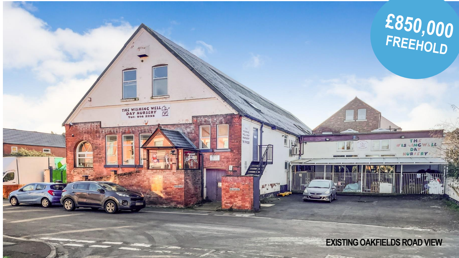
EXISTING OAKFIELDS ROAD VIEW