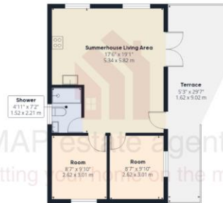
Ground Floor Building 3