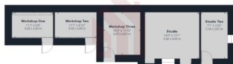
Ground Floor Building 4