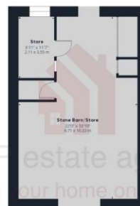
Ground Floor Building 3