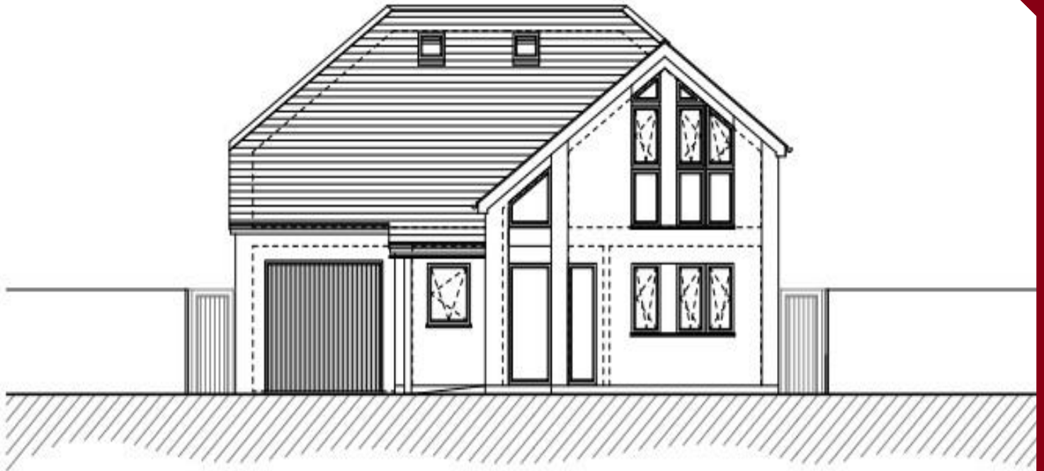
Proposed West Elevation 1:100