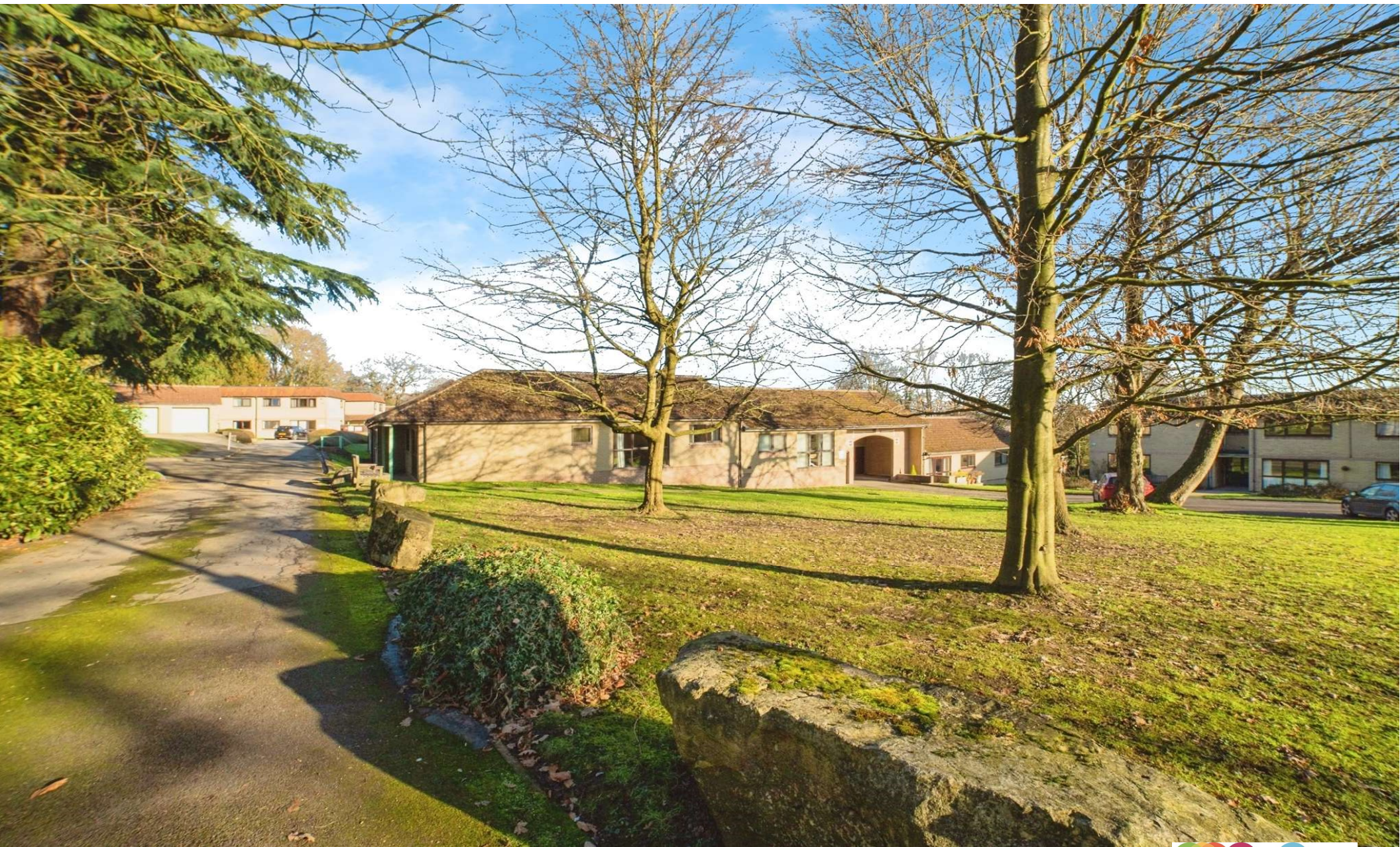
Fieldfare House High Street, Old Whittington Chesterfield S41 9LQ