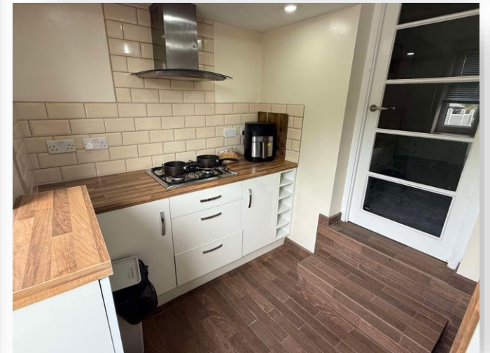
Chesterfield Road, Barlborough CHESTERFIELD S43 4TT