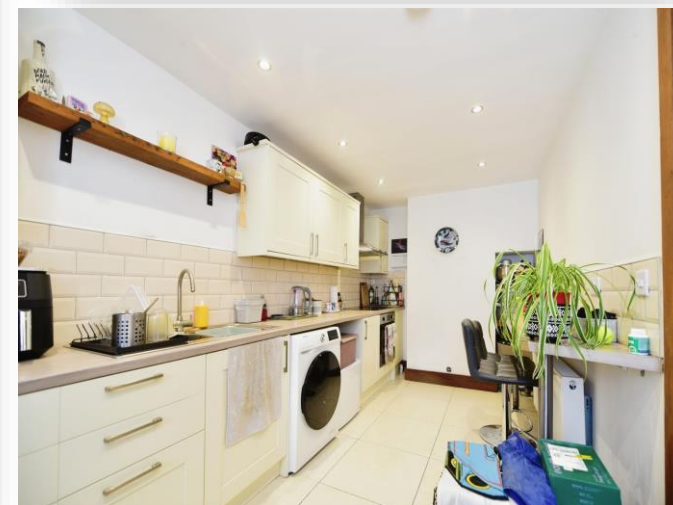
Rose Cottage Breck Lane, Barrow Hill Chesterfield S43 2NP