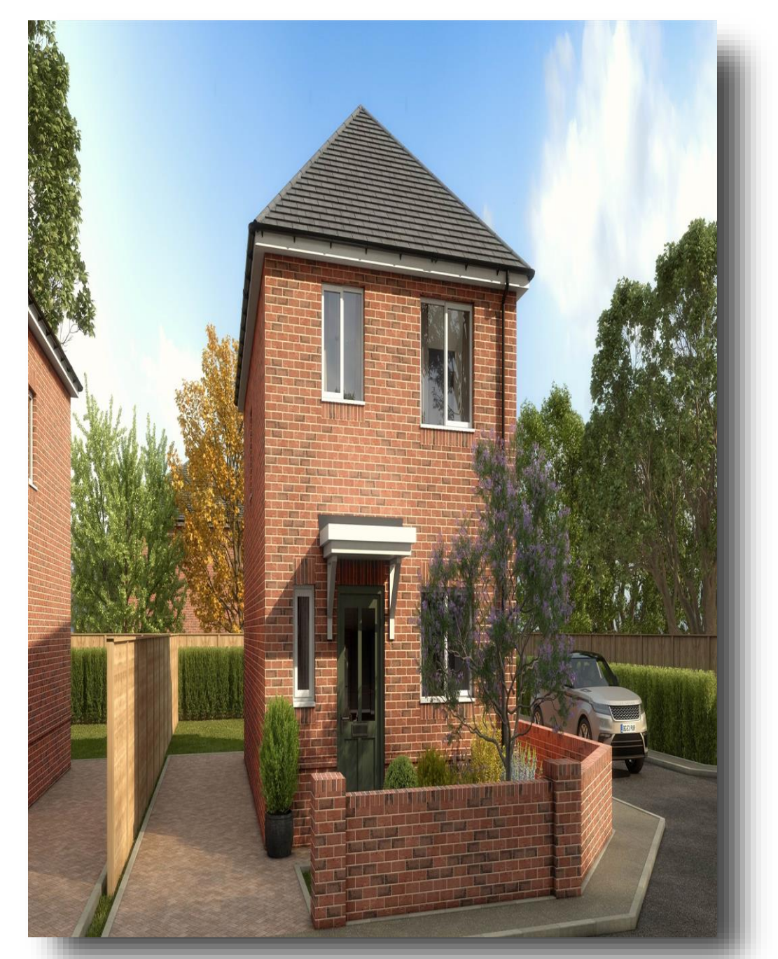
Westfield Way, Clowne Chesterfield S43 4ND