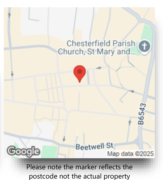
view this property online williamhbrown.co.uk/Property/CSF104356