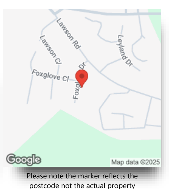
view this property online williamhbrown.co.uk/Property/CSF104047