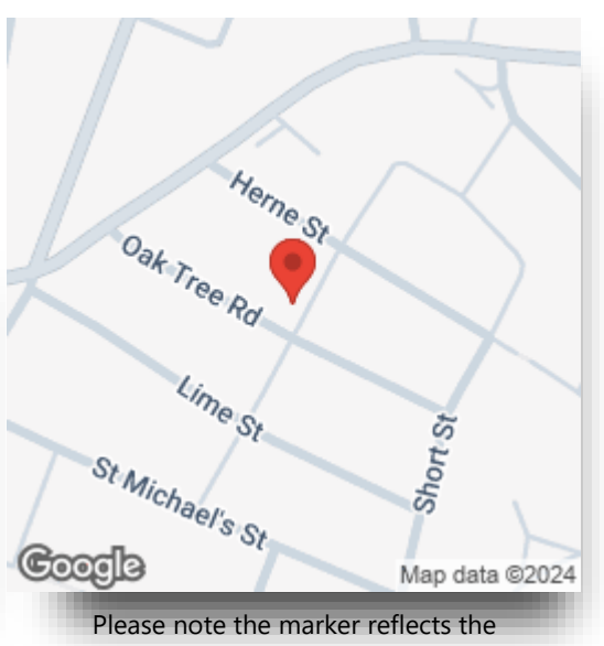
view this property online williamhbrown.co.uk/Property/CSF104059