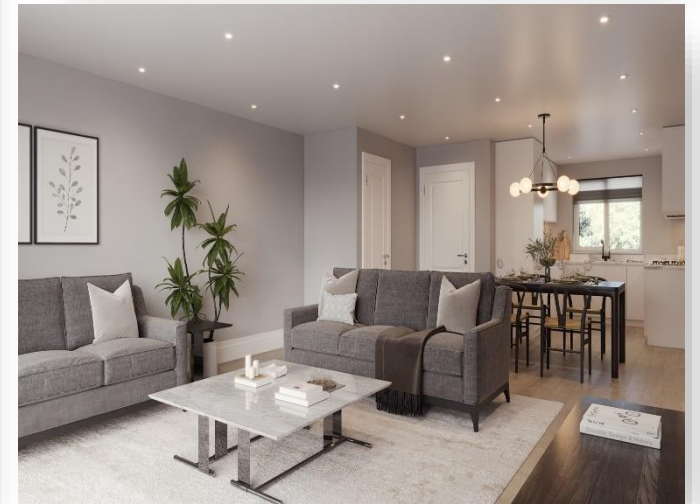
The Willows Jubilee Crescent, Clowne Chesterfield S43 4ND