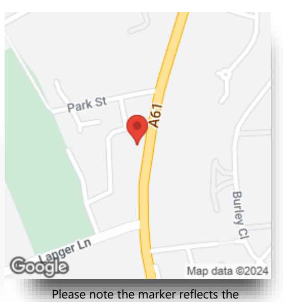
view this property online williamhbrown.co.uk/Property/CSF103807