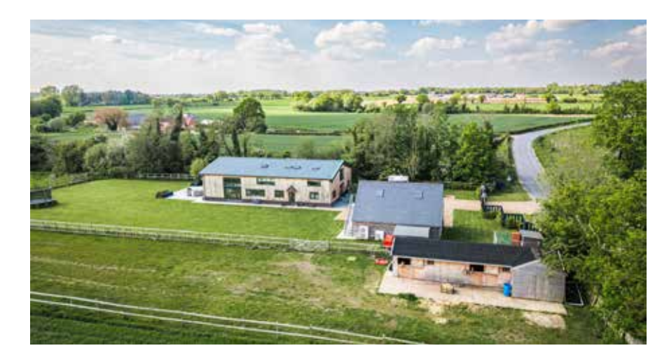
Elevated photo of The Old Grain Store

"Having the woodlands nearby means I can explore new routes when I'm walking my dogs each day."