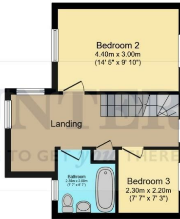
First Floor Floor area 37.3 sq.m. (402 sq.ft.)