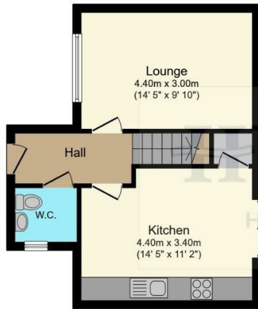
Ground Floor Floor area 37.3 sq.m. (402 sq.ft.)