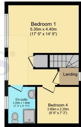
Second Floor Floor area 32.6 sq.m. (350 sq.ft.)

Total floor area: 107.2 sq.m. (1,154 sq.ft.)