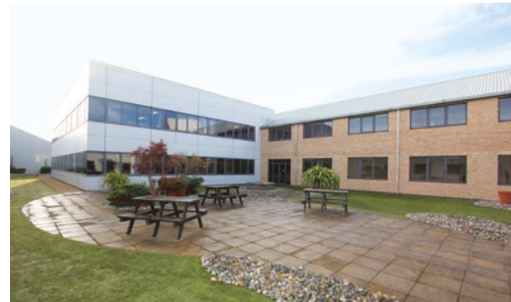
Communal Courtyard Garden.