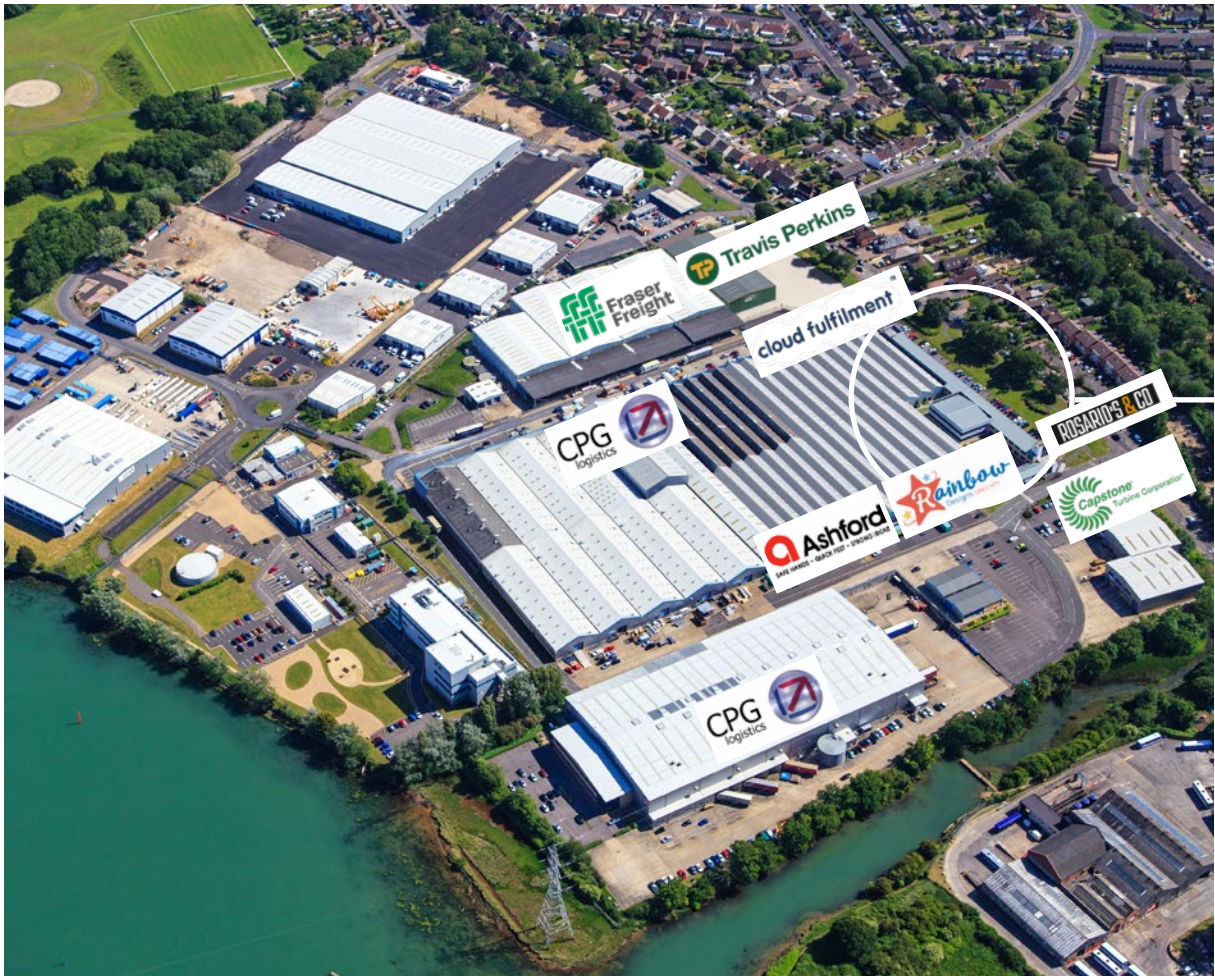
Aerial photograph of Fareham Reach Business Park looking south west.