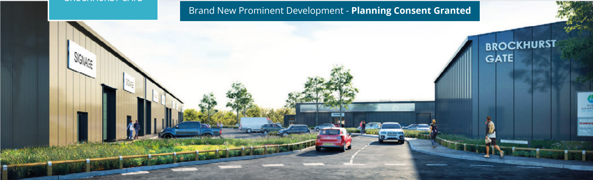
Artist's CGI impression of finished development

Brand New Prominent Development - Planning Consent Granted