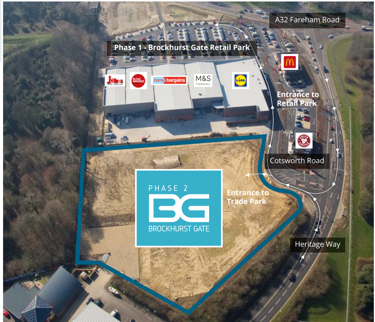
Aerial photograph of Phase 2 - Brockhurst Gate looking South West