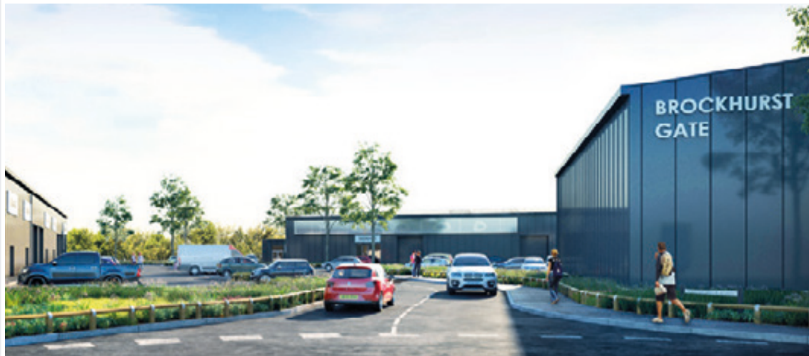
Artist's CGI impression of finished development