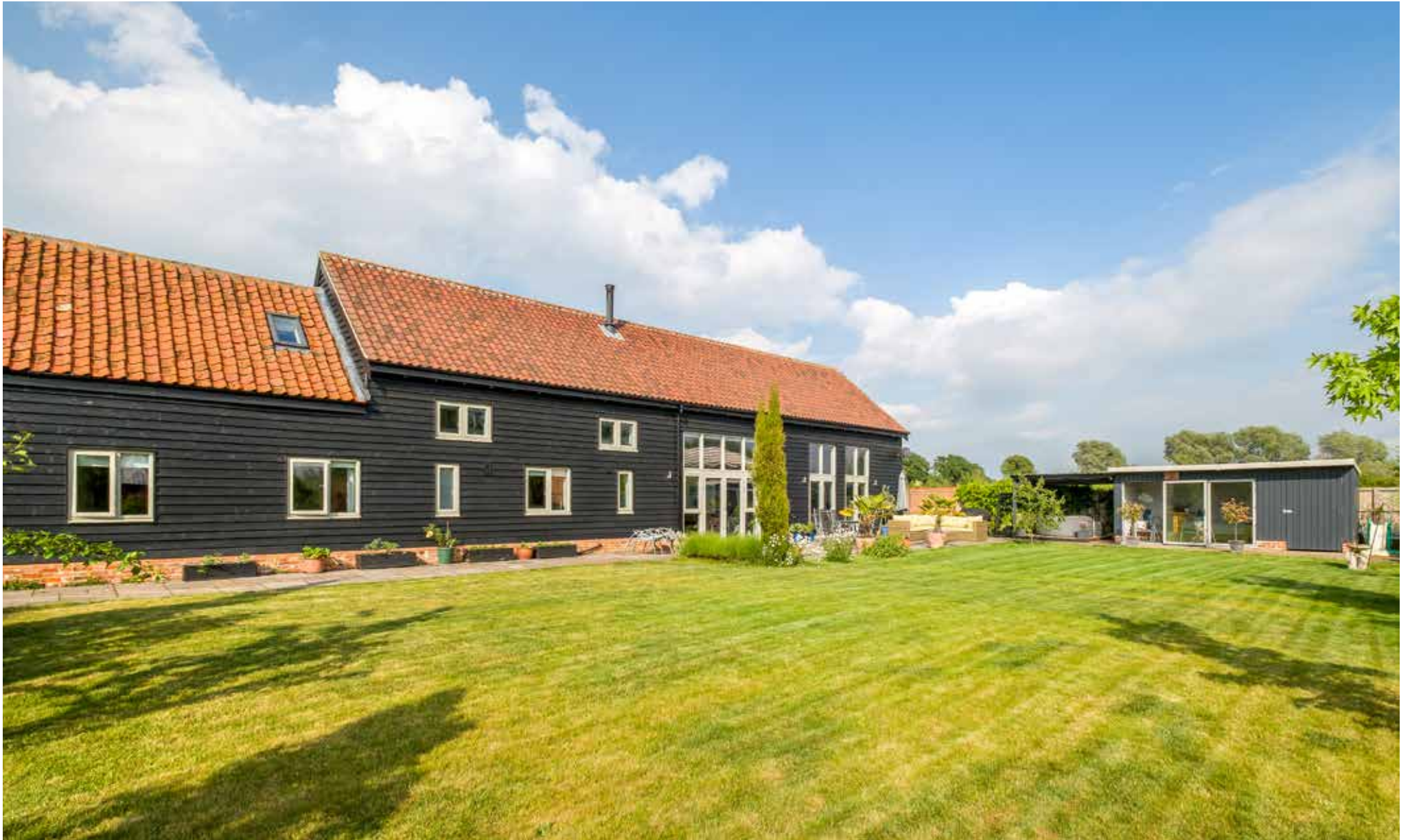
The Shedd Yarmouth Road | Kirby Cane | Norfolk | NR35 2HJ