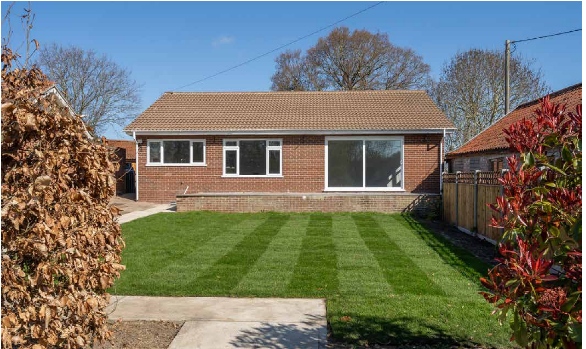
The Bungalow Flixton Marsh Lane | Blundeston | Suffolk | NR32 5PH