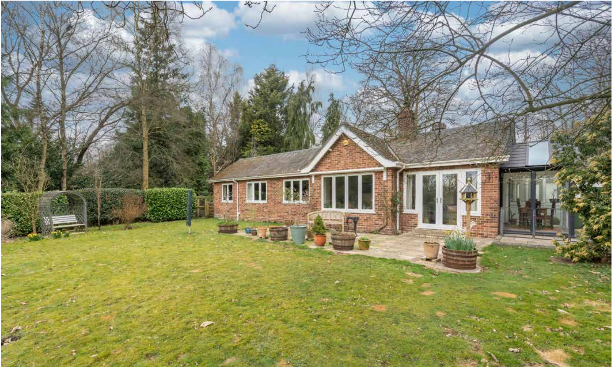
Fenside 40 Yarmouth Road | Broome | Norfolk | NR35 2PE