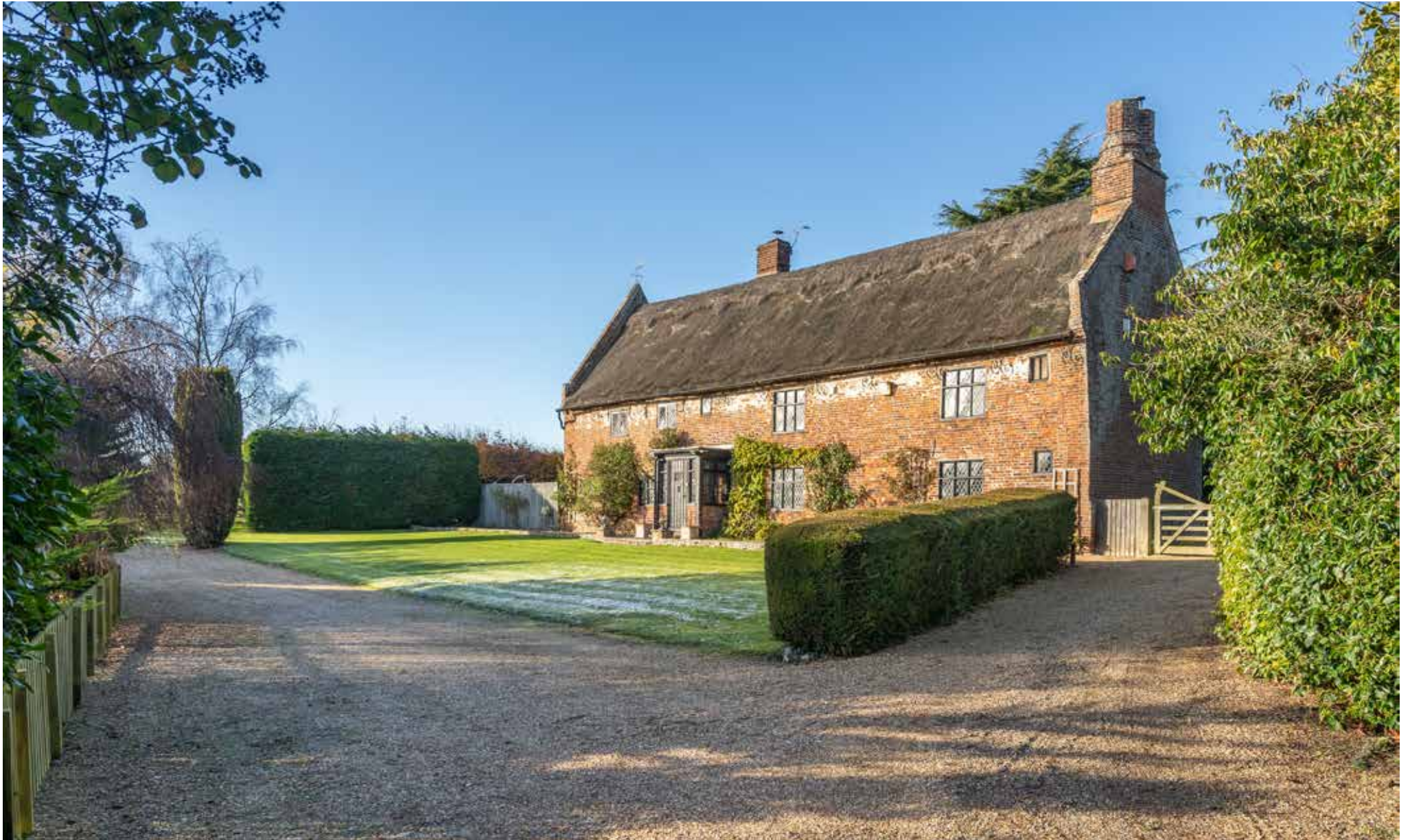
The Manor House Browston Lane | Browston | Norfolk | NR31 9DP