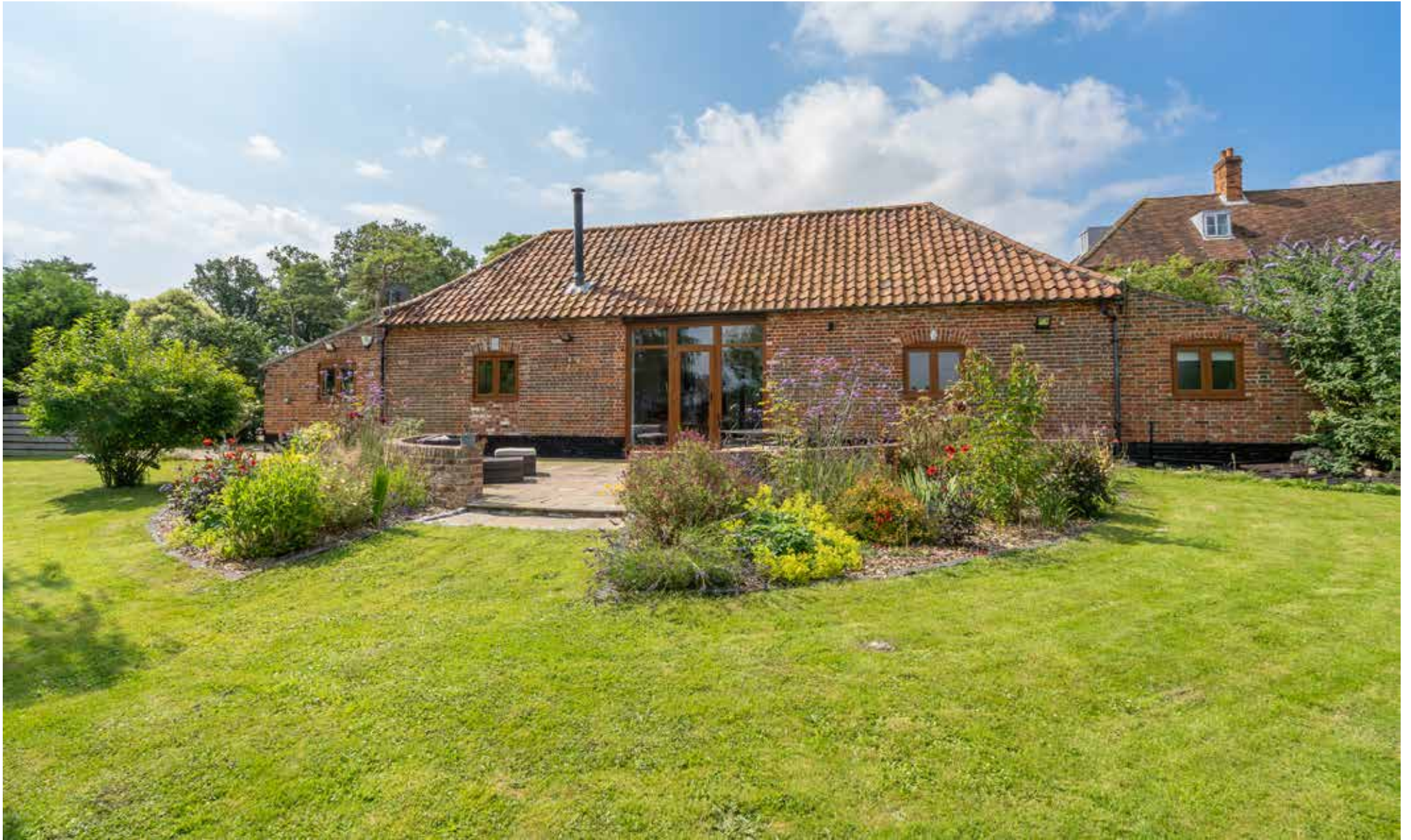
The Pump House Viewpoint | Shipmeadow | Norfolk | NR34 8EX