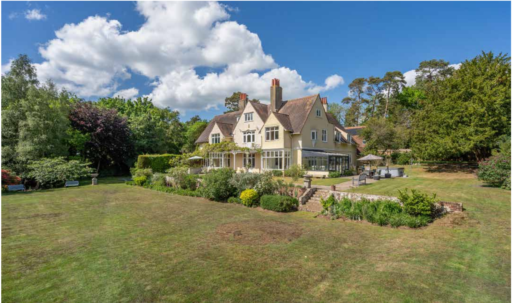
Leet Hill House Yarmouth Road | Kirby Cane | Norfolk | NR35 2HJ