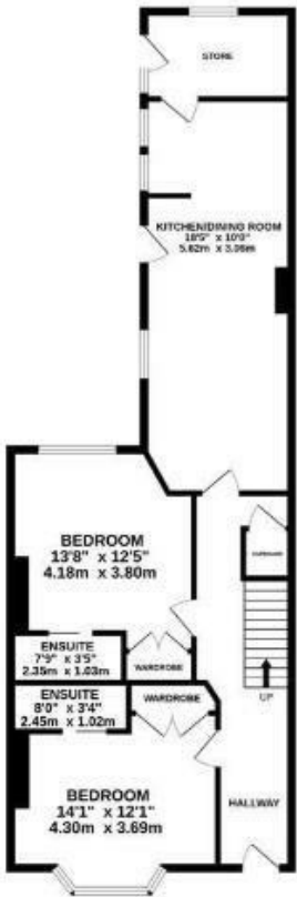
GROUND FLOOR 830 sq ft. (76.0 sq.m.) approx.