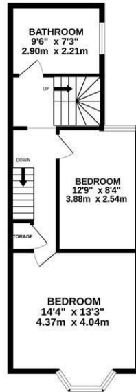
1ST FLOOR 464 sq.ft. (43.1 sq.m.) approx.