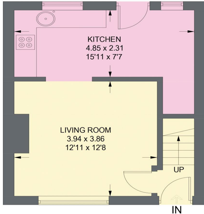
GROUND FLOOR 31.3 SQ M / 337 SQ FT

APPROXIMATE GROSS INTERNAL AREA = 62.3 SQ M / 671 SQ FT