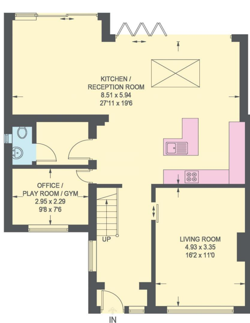
GROUND FLOOR 88.9 SQ M / 957 SQ FT

APPROXIMATE GROSS INTERNAL AREA = 160.5 SQ M / 1728 SQ FT