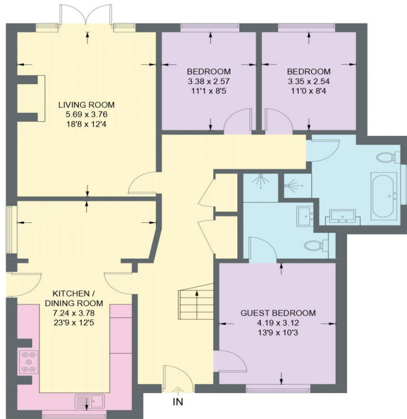
GROUND FLOOR 115.2 SQ M / 1240 SQ FT

APPROXIMATE GROSS INTERNAL AREA = 138.8 SQ M / 1494 SQ FT