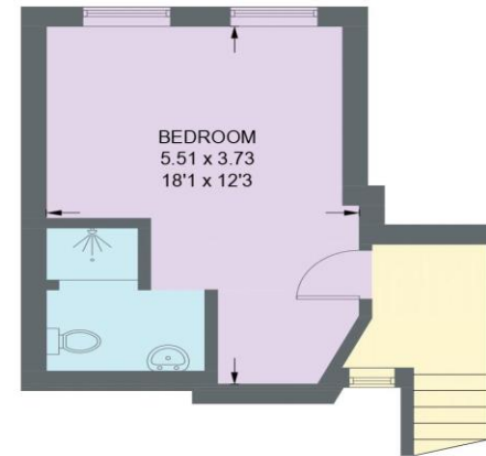
FIRST FLOOR 23.6 SQ M / 254 SQ FT

Illustration for identification purposes only, measurements are approximate, not to scale.