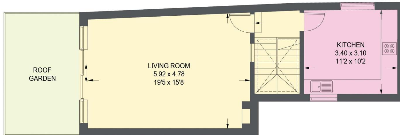
FOURTH FLOOR 45.7 SQ M / 492 SQ FT

APPROXIMATE GROSS INTERNAL AREA = 93.7 SQ M / 1009 SQ FT