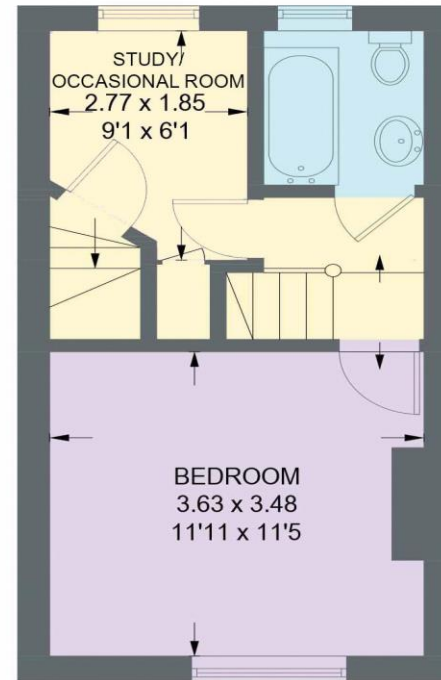
FIRST FLOOR 26.2 SQ M / 282 SQ FT