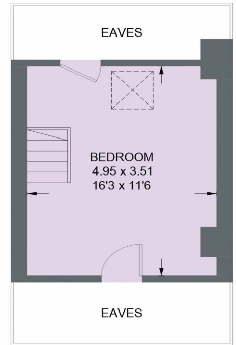
SECOND FLOOR 17.3 SQ M / 186 SQ FT

Illustration for identification purposes only, measurements are approximate, not to scale.