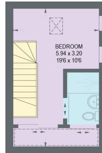
FIRST FLOOR 20 SQ M / 215 FT