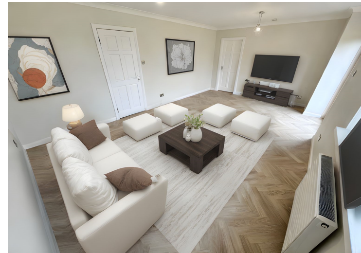
Selvieland Farm Cottages Houston Road, Houston