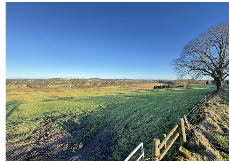
8 Torr Farm Steading, Torr Road, Bridge of Weir