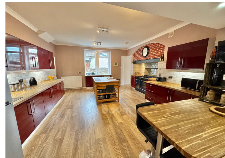
Sunnyside, 16 South Crescent Road, Ardrossan