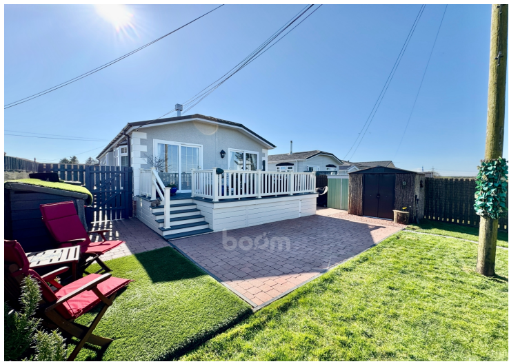
30 Heather Bank Park, Neilston, Glasgow