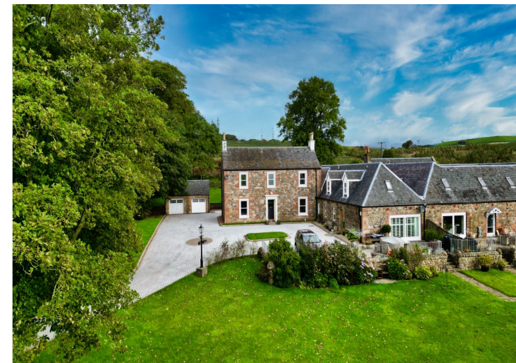
Munnoch Farmhouse, Dalry