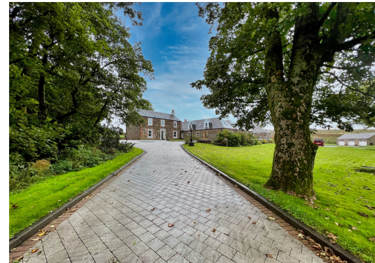
Munnoch Farmhouse, Dalry