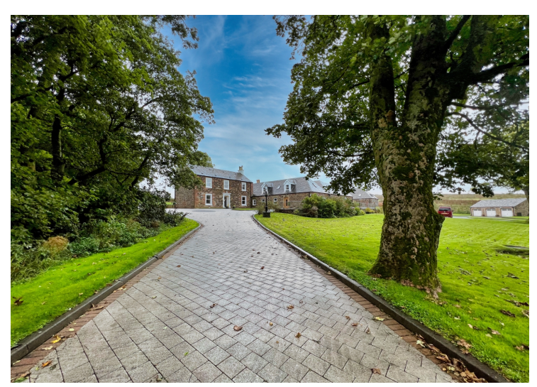
Munnoch Farmhouse, Dalry