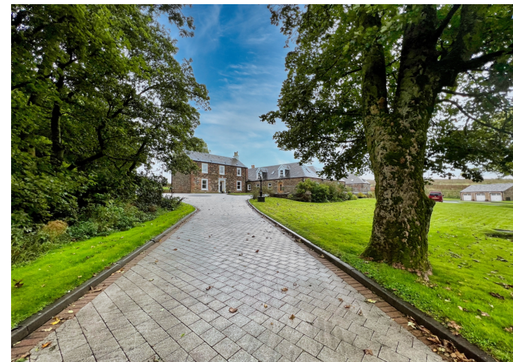
Munnoch Farmhouse, Dalry